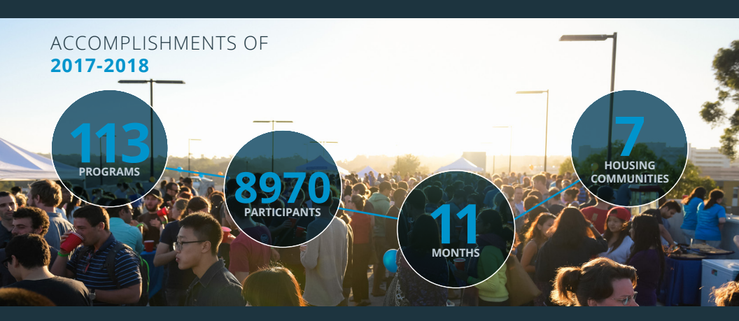
Teaching Social Responsibility